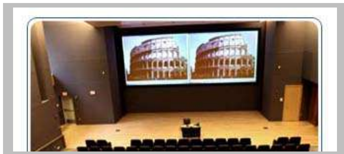
Nelson Mandela Auditorium, University of North Carolina